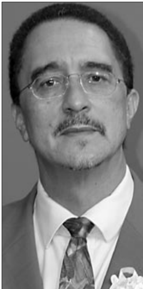
Prime Minister Dr. Kenny Anthony

I realize that the contribution of the yachting sector is perhaps not as well known as it ought to be, and that it may actually be greater than is reported. The latest figure that we have, EC$139.2 for 2004, is based on incomplete data. I expect that the MIASL will take the necessary steps to correct this, working assiduously with other agencies such as SLASPA and Customs. I also look