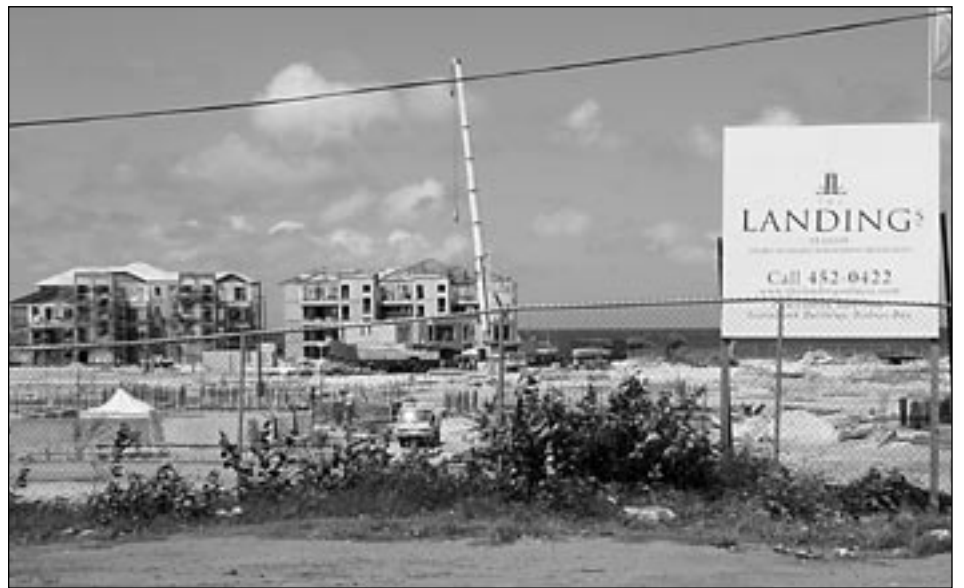
The Landings Construction Site

The other yachting and marine-related property also taking shape at Rodney Bay is The Harbour, which employs 85 workers. Tropical Homes, the company behind The Harbour, says that project too is quickly taking shape. The Landings and The Harbour are both major investments in the tourism and yachting industry sector by local hoteliers and entrepreneurs.